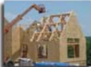
TIMBER FRAME & SIPS