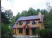
GREEN BUILT HOME